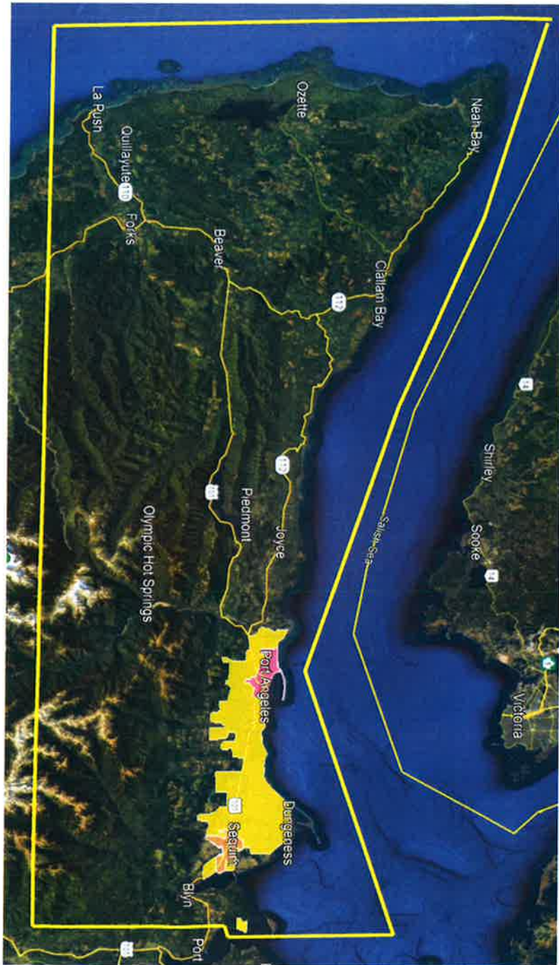
EXHIBIT A: FRANCHISE AREA AND SERVICE AREA